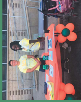
FNP Residents at New Settlement

Residents provide health education based on Community Identified topics Placements focus on food insecurity and community gardens and medicinal plants.