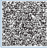
VIDEO: Meet Sutter Health's First Doctor of Nursing Practice Fellow

In May 2023, the final candidate was notified and readily accepted the inaugural one-year position of Fellow, beginning in January 2024. Public announcement was made in June 2023 and the fellowship garnered national attention. The fellowship is currently offered annually, with the goal of soon offering bi-annually.